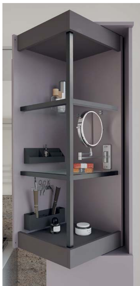
With dressing station option