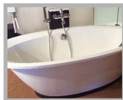
BATHTUB WITH INTERIOR & EXTERIOR FINISH