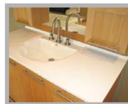
ONE PIECE VANITY TOP