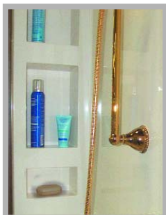
INTERIOR OF SHOWER COLUMN