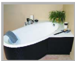
BATHTUB & TOP DECK