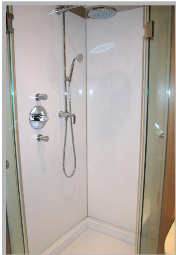
SHOWER WALL PANELS